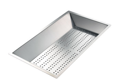
Stainless steel perforated tray

* only in combination with the accessory 8644 101