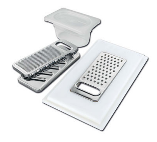
Graters kit with ring-holder and food collection tray 8159 101

* only in combination with the accessory 8644 101